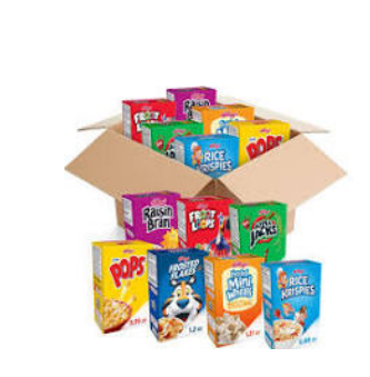
Does your family use mini/single-serve cereal in the mornings? If so, can you please save your empty boxes for an upcoming project? Boxes can be dropped off in the lobby or sent in with your student. Thank you!