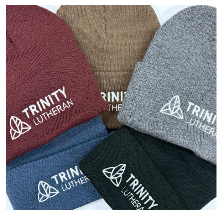
Interested in Trinity <a>Swaq</a>??